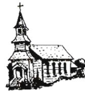
st. mary church nicasio

+ St. Joseph Church, Magdalena, Colombia (sister parish) +