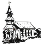
st. mary church nicasio

+ St. Joseph Church, Magdalena, Colombia (sister parish) +