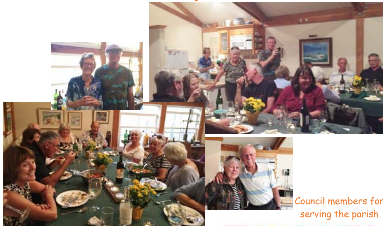
Council members for serving the parish