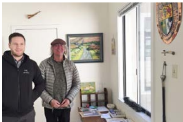
Finance auditor conducting parish audit, also shares interests with Fr. on antiques, train sets, soccer & music