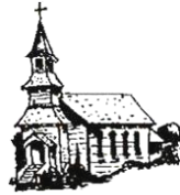
st. mary church nicasio

+ St. Joseph Church, Magdalena, Colombia (sister parish) +