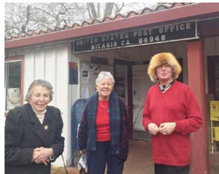
Cold winter day in Nicasio