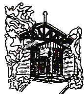
st. cecilia church lagunitas