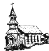
st. mary church nicasio

+ St. Joseph Church, Magdalena, Colombia (sister parish) +