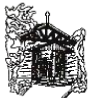
st. cecilia church lagunitas