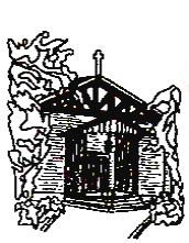
st. cecilia church lagunitas