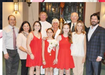
The Kerbs and Family