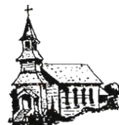
st. mary church nicasio

To be Nurtured by Christ's Word, Supported by a Faith Loving Community, and to Serve the Needs of Others as Called to Minister.