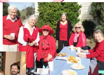
Valentine Day at St. Mary's