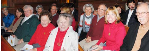
Very special thank you to everyone who came and support this fund raiser.