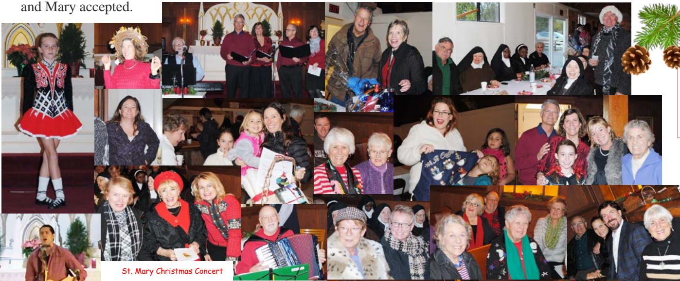
St. Mary Christmas Concert

Thanks all the musicians who donated their time, all the businesses donated wine & food for the reception.