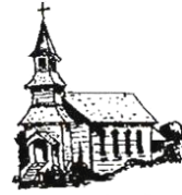
st. mary church nicasio

+ St. Joseph Church, Magdalena, Colombia (sister parish) +