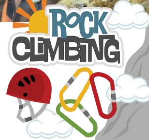
Youth Trip Rock Climbing.