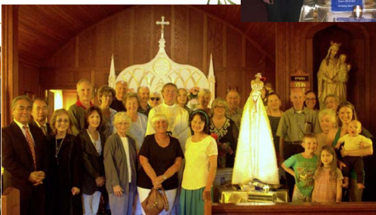
Our Lady of Fatima visits St. Mary's