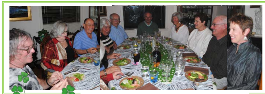
Fr. hosting the Celtic Dinner (Palm Brunch fund raiser) last Sat.