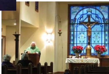
Faithful at weekday Mass