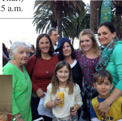
4 Generations of the deRuttles Family joined 50,000+ at the Walk-For-Life last Sat.