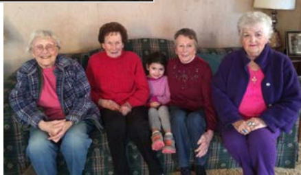
Home Mass at Grace's