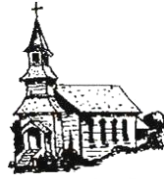
st. mary church nicasio

To be Nurtured by Christ's Word, Supported by a Faith Loving Community, and to Serve the Needs of Others as Called to Minister.