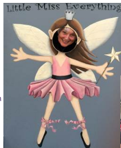
Little Miss Everything