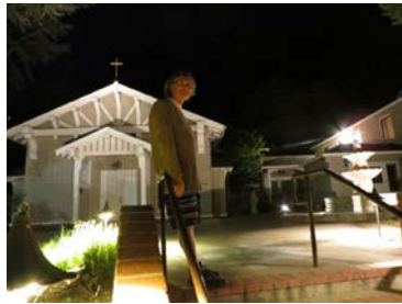
Neither Father, bright light, nor deer-resistant varieties can keep the deers out of St. Cecilia's garden! 😊