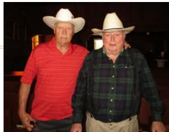
Cowboys (horsemen) at St. Mary's