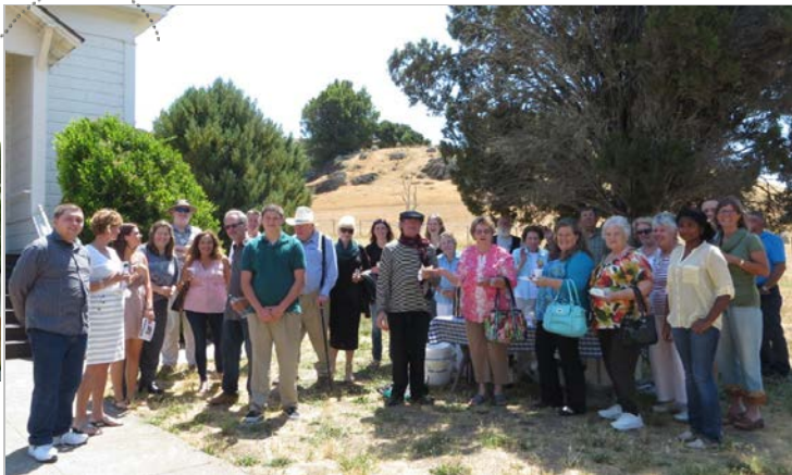
Coffee social after Mass at St. Mary's