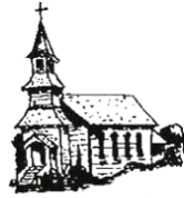
st. mary church nicasio

To be Nurtured by Christ's Word, Supported by a Faith Loving Community, and to Serve the Needs of Others as Called to Minister.