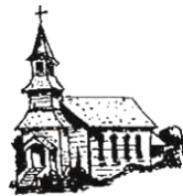
st. mary church nicasio

To be Nurtured by Christ's Word, Supported by a Faith Loving Community, and to Serve the Needs of Others as Called to Minister.