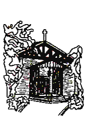
st. cecilia church lagunitas