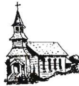
st. mary church nicasio

+ St. Joseph Church, Magdalena, Colombia (sister parish) +