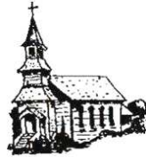
st. mary church nicasio

+ St. Joseph Church, Magdalena, Colombia (sister parish) +