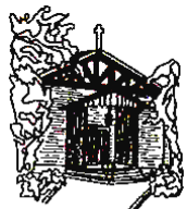
st. cecilia church lagunitas