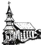
st. mary church nicasio

To be Nurtured by Christ's Word, Supported by a Faith Loving Community, and to Serve the Needs of Others as Called to Minister.