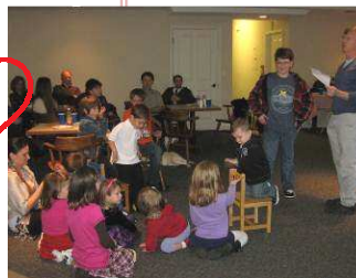
Family quizzes & prizes