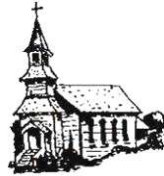
st. mary church nicasio

+ St. Joseph Church, Magdalena, Colombia (sister parish) +