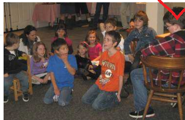
Next generations of the deRuttes