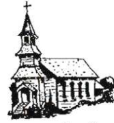
st. mary church nicasio

+ St. Joseph Church, Magdalena, Colombia (sister parish) +