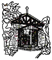
st. cecilia church lagunitas