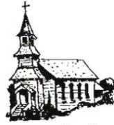
st. mary church nicasio

+ St. Joseph Church, Magdalena, Colombia (sister parish) +