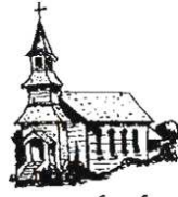
st. mary church nicasio

+ St. Joseph Church, Magdalena, Colombia (sister parish) +