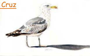
Youth Trip to Santa Cruz July 24-25, 2012