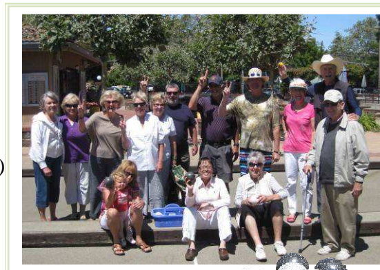
Bocce Ball Tournament, July 13, 2012 St. Cecilia's beat St. Mary's

** No Mass Wednesday & Thursday. Friday Mass at St. Mary's.