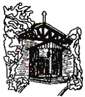
st. cecilia church lagunitas