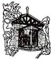
st. cecilia church lagunitas