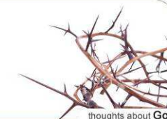
thoughts about God

Easter the ultimate sacrifice and then resurrection