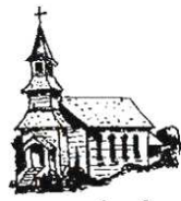
st. mary church nicasio

+ St. Joseph Church, Magdalena, Colombia (sister parish) +