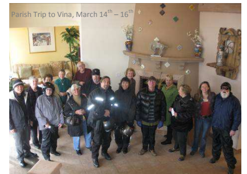
Parish Trip to Vina, March 14 th - 16 th