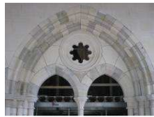
Visiting the Cistercian Monastery Church & Chapter House