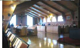
Monks praying breviary