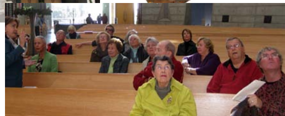
Visit to Oakland's Cathedral of Christ the Light Friday, December 2 nd