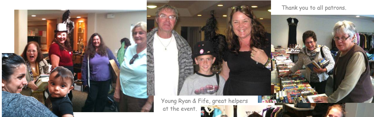
Thank you to all patrons.

The question put to Jesus is to trap him on the question of taxes. The Pharisees opposed paying taxes to the Romans. The Herodians approved Roman taxes. Whose position would Jesus denounce? His answer recognized both the state and the temple have financial rights. Give to Caesar what is Caesar's and to God what belongs to Him. In the final analysis, the rights of God are not to be supplanted by the state.