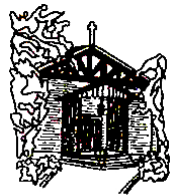
st. cecilia church lagunitas