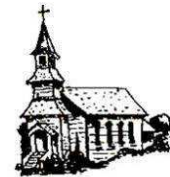
st. mary church nicasio