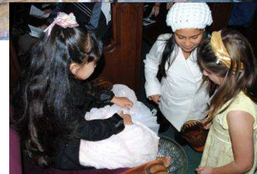
Foot Washing by the Catholic community