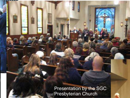
Presentation by the SGC Presbyterian Church