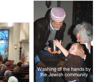
Washing of the hands by the Jewish community