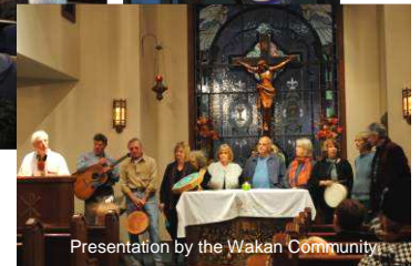
Presentation by the Wakan Community