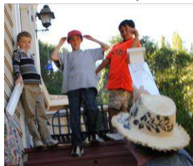
First to turn on the fountain after blessing