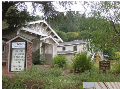
Installation of St. Cecilia's Fountain, August 22, 2010