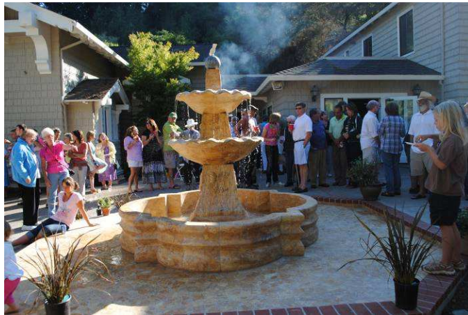
Incorporated symbolisms from 6 world religions, St. Cecilia's Fountain is possibly the only ecumenical fountain in the world