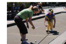
Bocce Ball, game of precision