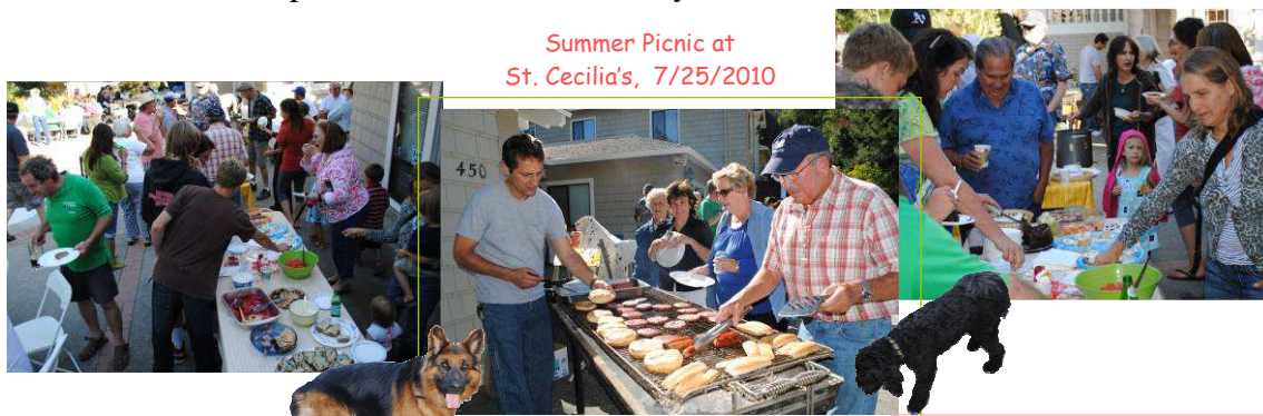
Summer Picnic at St. Cecilia's, 7/25/2010

This is a powerful story of weighing one's life against the time and energy one puts into this world in parallel to the eternal life to come, and how do those scales balance. It seemed Christ enjoyed the life of this world, he drank, partied and played. He had fun, but he also enjoyed the life of the soul and of the spirit. The balance made him a complete man, as it does for any man or woman.