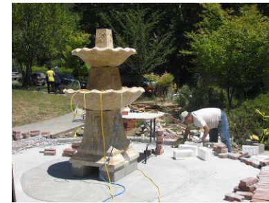
Art working on the fountain