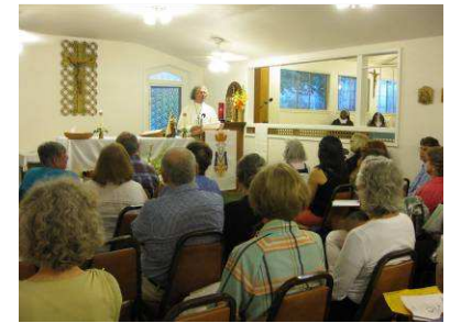
Novena for Our Lady of Mount Carmel at the Carmelite Monastery, 7/8-7/16