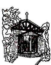
st. cecilia church lagunitas