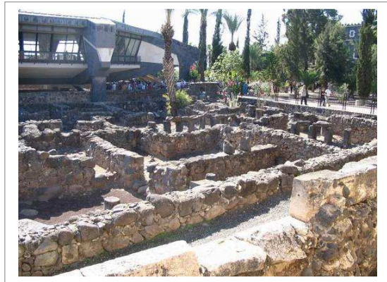
Saint Peter's Home in Capernaum

Peter's home on the shores of the Sea of Galilee, in the village of Capernaum. Maybe it was the first parish of christianity. Certainly the first seat of church power as Peter is the first pope. I wonder how many discussions, Gospel talks, liturgies, parish activities took place from this house.