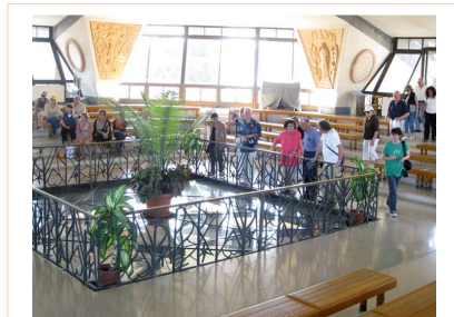
Interior of the Franciscan church, with glass floor for viewing the House of St. Peter.