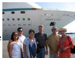
Jesus Baptismal by Jordan River