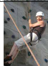
Kitty Rock Climbing