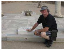
St. John's Tomb, Ephesus

There are those who give little of the much which they have, and there are those who have little and give all. Their coffer is never empty and from their eyes God smiles upon the earth.