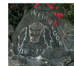
Five loaves two fish

"Did You Know?" How old does a child need to be in order to stay alone? Experts say children do not have the mental maturity to cross busy streets by themselves until they're about 10 or 12 years old. (Pedestrian injuries rank third in child fatalities, behind traffic accidents and drowning.) Parents who are certain their young children would never walk away with a stranger will be shocked to learn that studies show they probably will. Stay alert and vigilant. - Office of Child & Youth Protection, SF Archdiocese