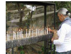
St. Mary's house, Ephesus