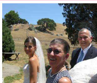
Cows gathered around the church partaking in the wedding celebration at St. Mary's last Sunday