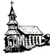
st. mary church nicasio

web: www.stcecilia-lagunitas.org - www.stmary-nicasio.org e-mail: stcecilia.lagunitas@yahoo.com - stmary.nicasio@yahoo.com