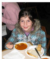
Ash Wednesday Soup Mass