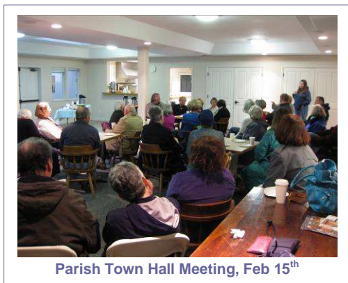
Parish Town Hall Meeting, Feb 15 th