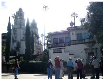
Parish Trip, February 17 th to February 19 th