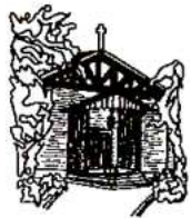
st. cecilia church lagunitas