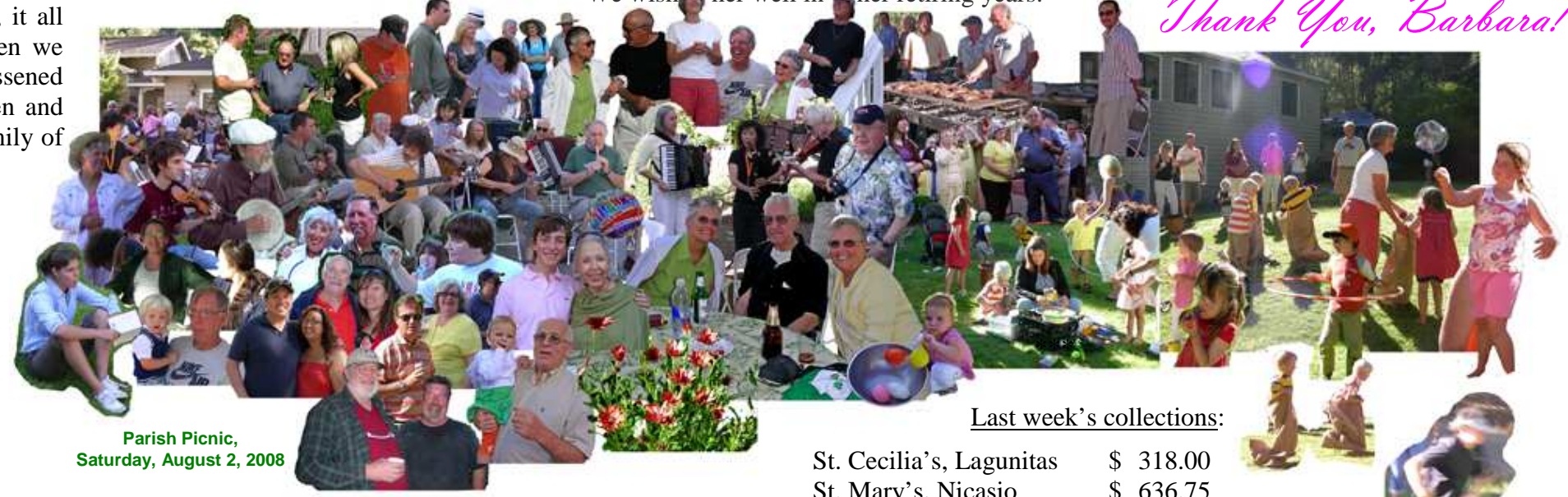
Parish Picnic, Saturday, August 2, 2008